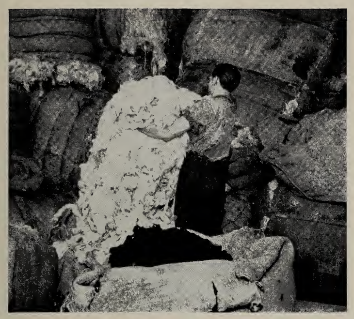
Another product-from raw wool-